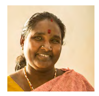
"My work gives me the confidence that I can support myself and my family on rainy days. My work makes me happy."