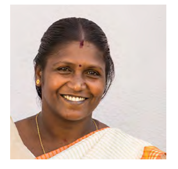
"My work travels to far off lands that I may never travel myself. For me it's like a part of me travelling with every product I make. My work takes my story to far off lands."