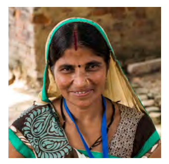
"This is not only embroidery or stitching but a respect and importance to women who have not seen opportunity in their lives."