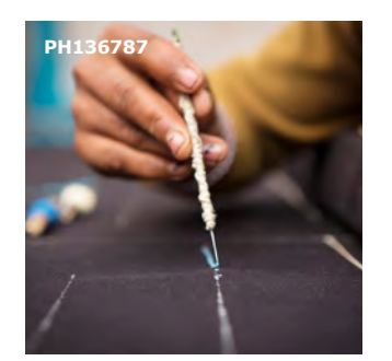
See glimpses of Indian traditional embroidery: <a href="https://www.youtube.com/watch?v=U9I1">https://www.youtube.com/watch?v=U9I1</a> fY-7Aw