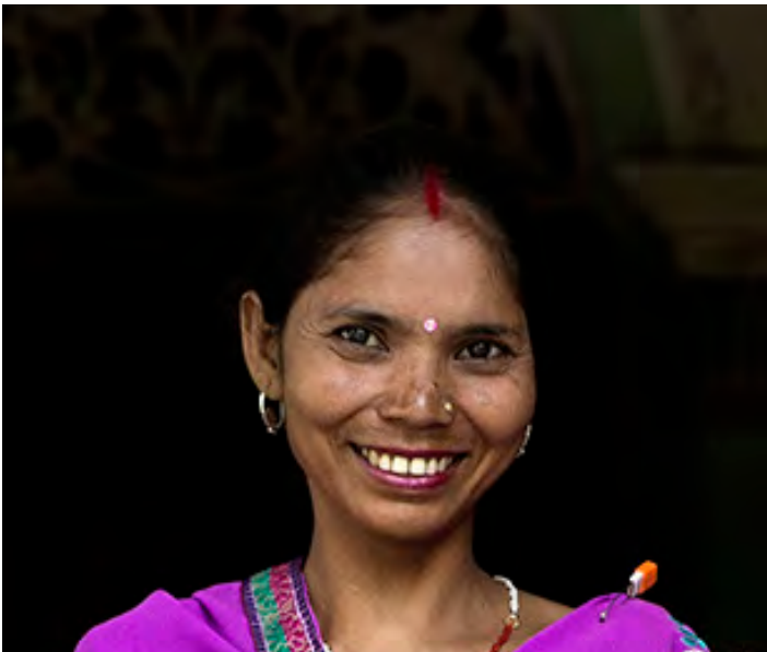
"The true empowerment will come mainly through economic empowerment and it's the key for social and community empowerment"

Watch the film about Saroj: https://www.youtube.com/watch?v=uPXOXmFCqNA